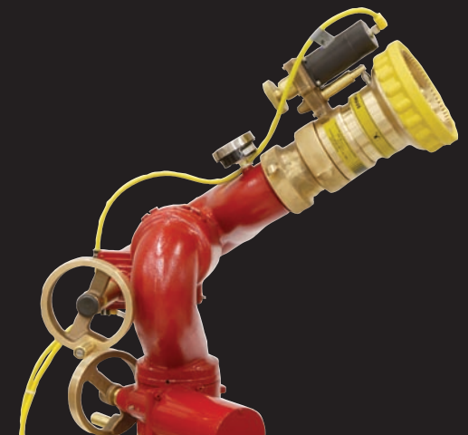
INDUSTRIAL SPIT-FIRE WATER CANNON